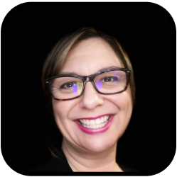
Alagamił