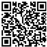
Photo contest: Upload your NESST photos to our Facebook Event Page, using this QR Code make sure to put your full name on the photo so we know who to declare the winner.

NESST Post Event Survey: When you are completing the please enter your email address into the last question to be entered into the Survey Draw: This draw will be done when the Survey has closed. The QR Code below will take you to the appropriate survey(s) for you.